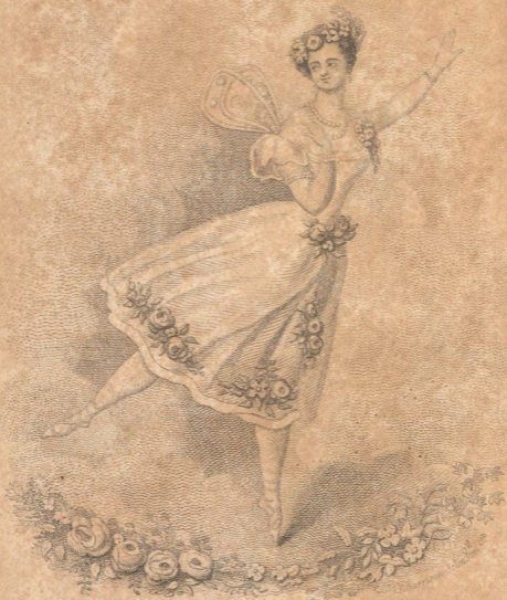
Mad lle Taglioni as La Sylphide.